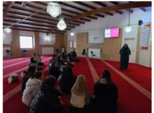
Tuesday afternoon